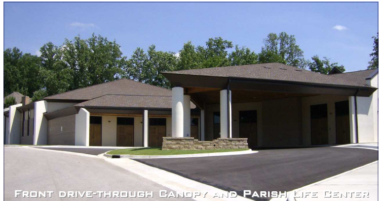
FRONT DRIVE-THROUGH CANOPY AND PARISH LIFE CENTER

The Parish Life Center was completed in 2011 and includes a gathering room, a full commercial kitchen and serving area, large and small meeting rooms, restrooms, curved walls, chapel, nursery, and drive through canopy. Construction consists of structural steel, glue laminated beams, wood trusses, CMU, block, brick veneer, and both modified bituminous and shingled roof on a complex roof pitch. This was an 18,000sf, $3,506,619 project.