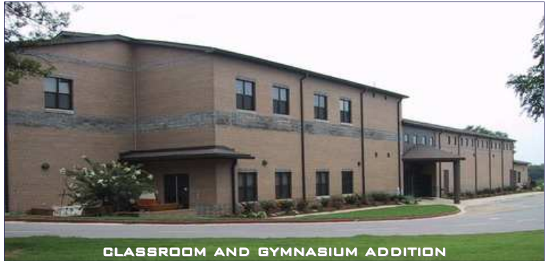
CLASSROOM AND GYMNASIUM ADDITION

The classroom and gymnasium addition to St. John the Baptist Catholic School provided an additional 33,000 square feet to the existing school facility. The building structure consists of CMU walls, structural steel, shingled roof, and brick veneer exterior. The two-story addition has a gymnasium with locker rooms, concession area, restrooms, kitchen, cafeteria, classrooms, and other supporting rooms. Completed in 2001 for $2,955,736.